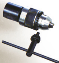
Chuck adapter on request