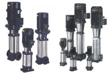
Vertical multistage centrifugal pump