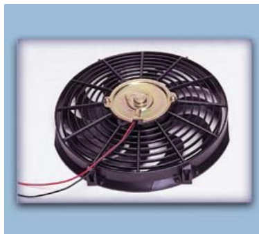
12" COOLING FAN