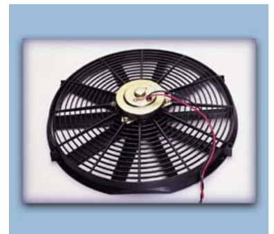
16" COOLING FAN