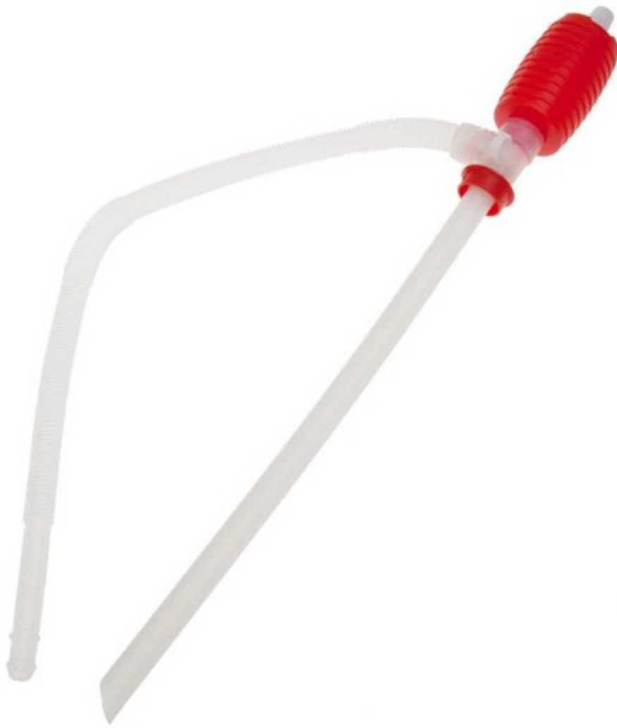
Small Syphon Pump