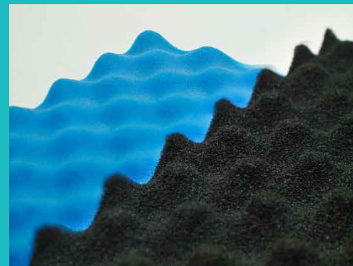
OP Cell Foam