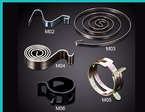
Stamped Hardware Factory