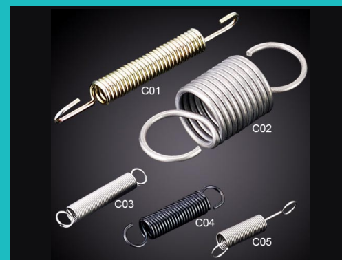
Springs For Molds-Dies