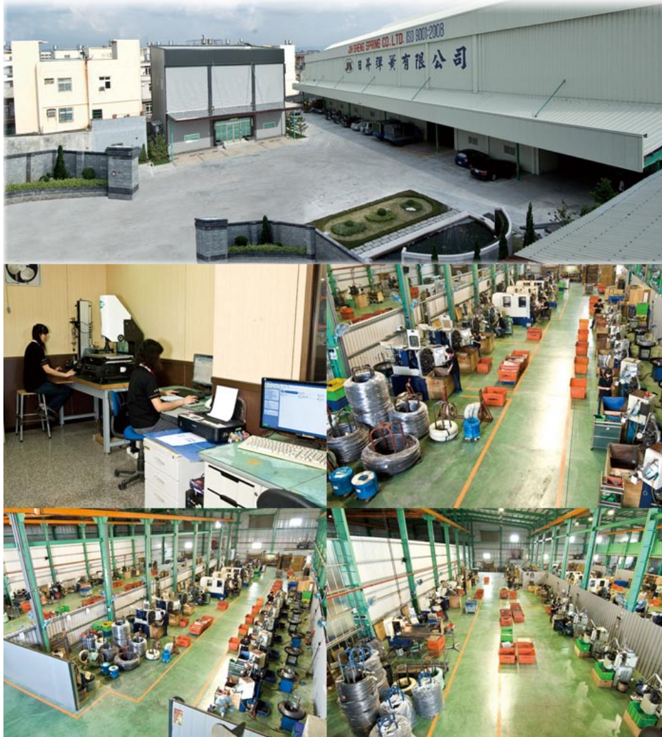
Spring Plant Facilities