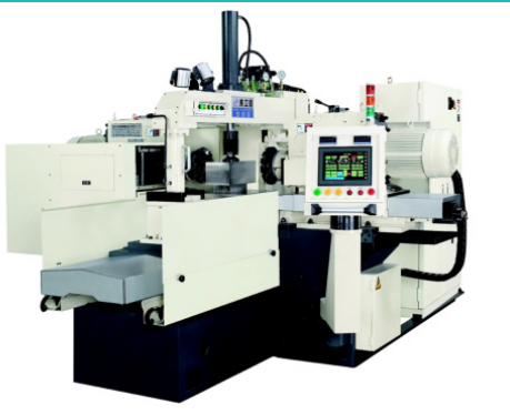
NC Double Sided Milling Machine

We, PARA MILL, produce NC double sided milling machine and milling head unit to provide the better solution for the user which is mainly focused on the heavy duty milling industries. The NC double sided milling machines are been widely applied to plastic and steel molds manufacturer. This kind of milling machine can capable with the cutting capacity of 75mm x 75mm to 1000mm x 1000mm with "one set-up for four sides" machining.