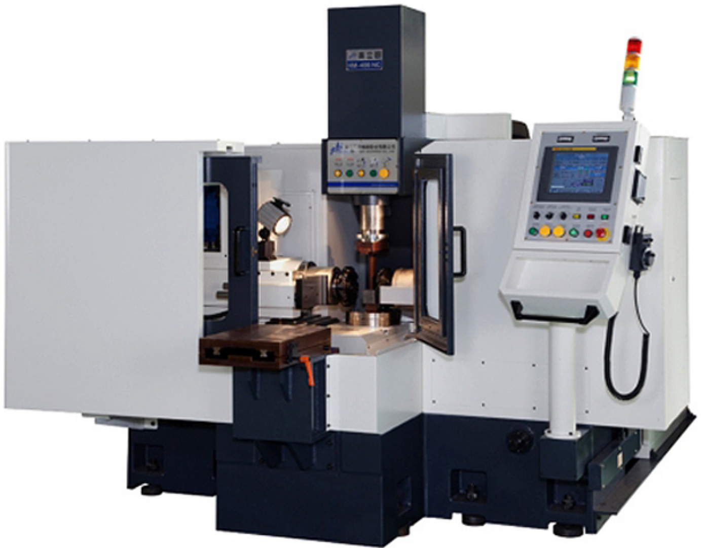
NC Double Sided Milling Machine