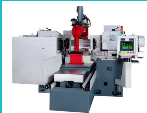
NC Double Sided Milling Machine