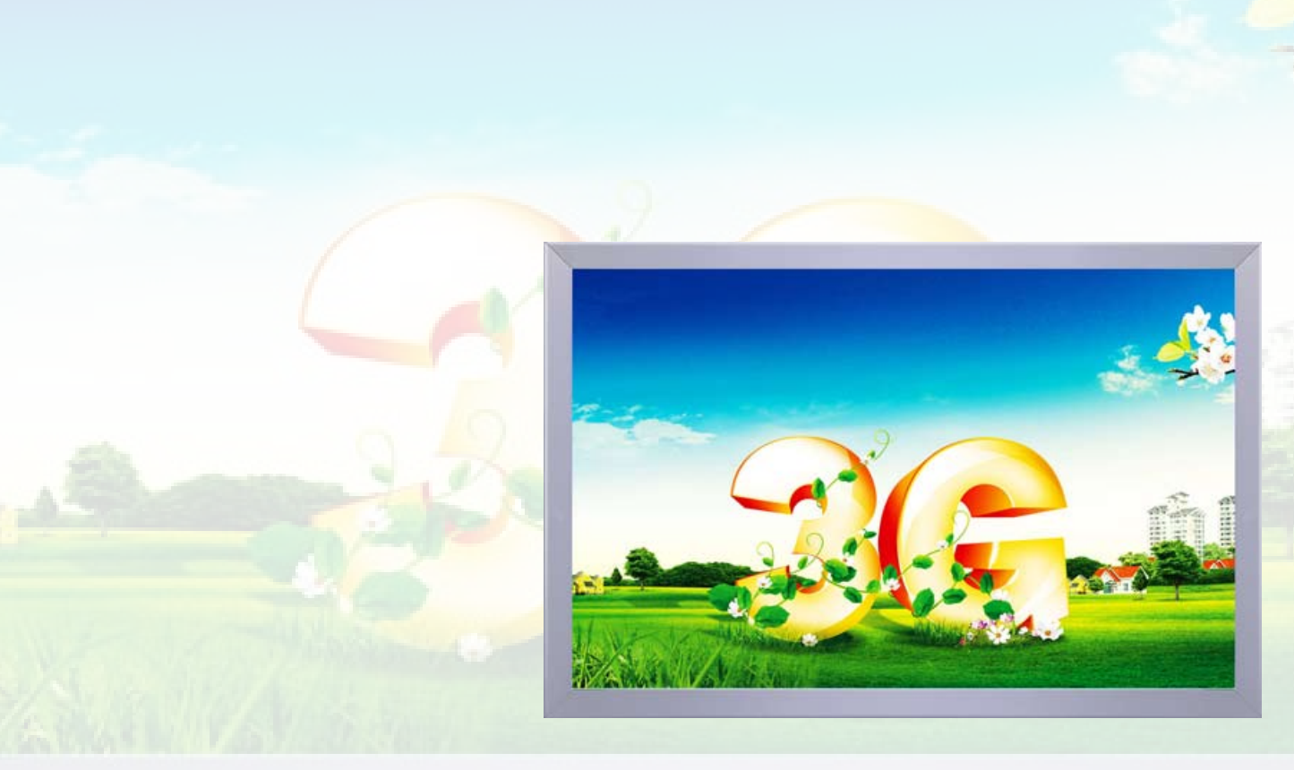
Ultra-thin light box series of Barnard