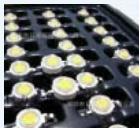
LED Encapsulants (molding)