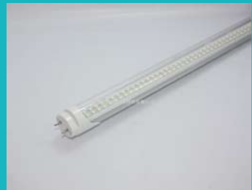
LED silicone sealant--encapsulants (SMD) BQ-4370