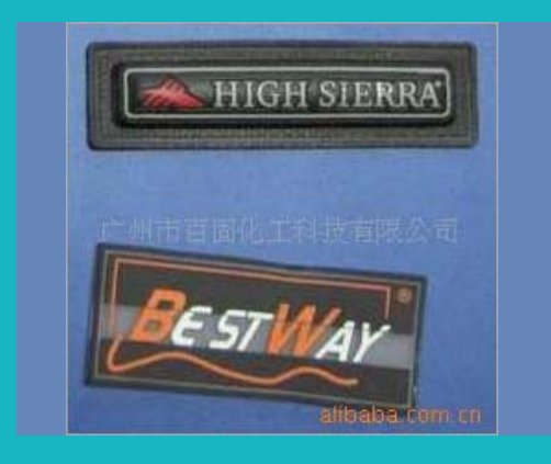
PU Crystal Plate Glue

Baizhuang Composite Materials specializes in R&D, manufacture of PU materials and silicone materials for electronic potting applied to e-filling, crystal signage, building sealing, and bonding. Backed by over 10,000 square meter plant, IT staff, first-class equipment, top R&D team, we lead in the domestic PU applications field.