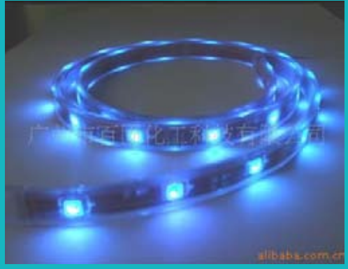
Packaging Glue for LED Flexible Strip