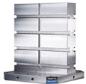
M/C DOUBLE SIDED TOOLING COLUMN