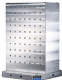
M/C DOUBLE SIDED TOOLING COLUMN