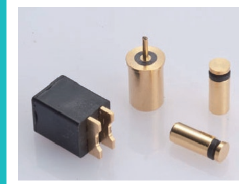
Tilt/Vibration/Rotation Sensor Switches