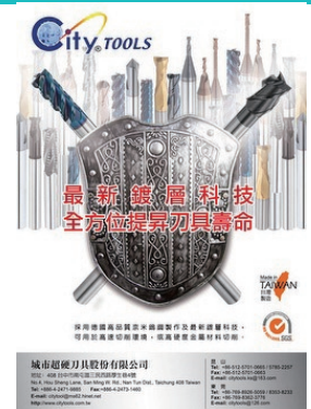
A700 A650 X600 X550 S500