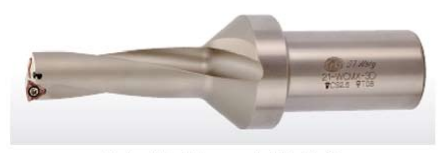
Indexable high speed drills (Dx3)