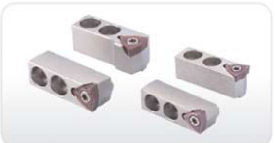
Rapid core-stay drills with alternative setting plates