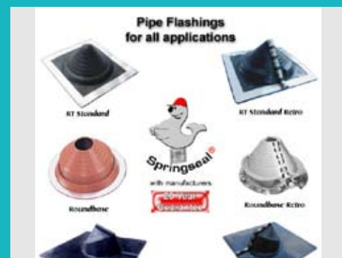
Rubber Parts and Saddle washers