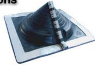
RT Standard Retro