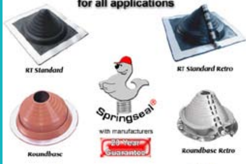
Round Base Pipe Flashings