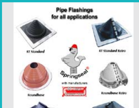
Rectangle Base Pipe Flashings