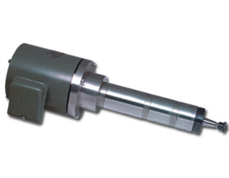
Form Grinding Spindle Unit