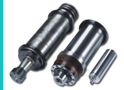
Spindle for Grinding Machine