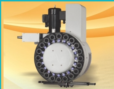
Disc Type Magazine (cam-type tool change)