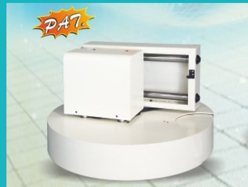
Automatic Tool Changing Systems