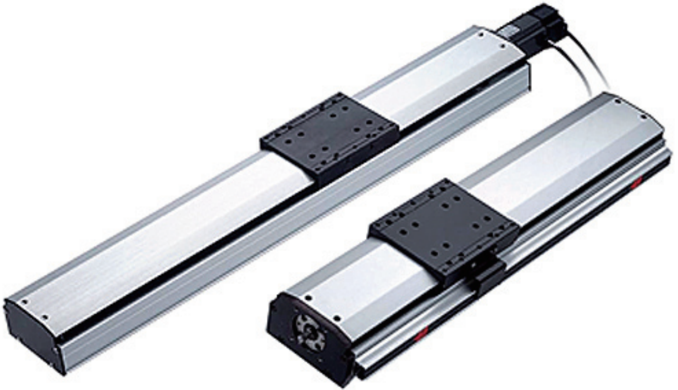
Modular slide-way with screw rod