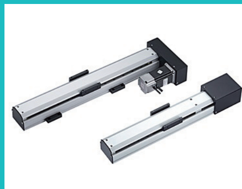
Modular slide-way with screw rod