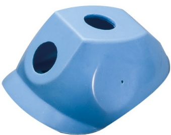
Rubber Gas Masks

Established in 1980, Shih Hsiang Enterprise Co., Ltd. has 30-plus years' experience in making rubber and silicone rubber parts, including O-rings, washers, packing, oil seals, airtight lid seals, auto-lamp wire grommets, metal-bonded rubber parts, valve stem seals, auto/PTW parts & accessories, and silicone rubbers for healthcare and food-processin ... [more]