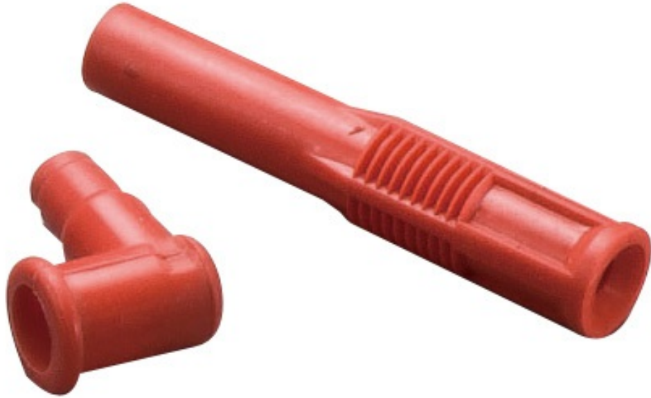
Ignition Cable Parts For Spark Plugs