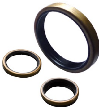
Metal-Bonded Oil Seals