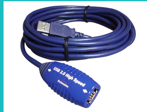
USB 2.0 Repeater Cable