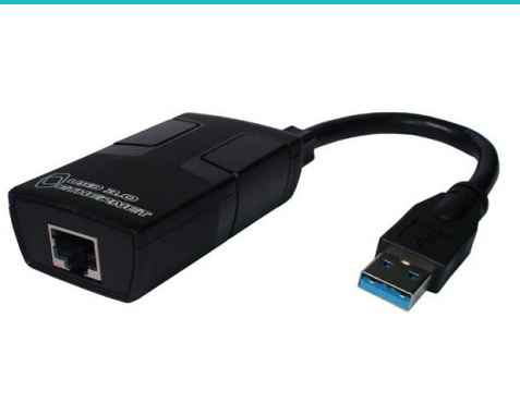
USB 3.0 to Ethernet Adapter

Chipset Communication Co., Ltd. has been a manufacturer of computer communication products in Taiwan for more than 17 years with working force of 200 personnel plus. Our main features are USB 3.0 / 2.0 & IEEE-1394 Peripherals, Video Splitter, Video Switch etc... it is our commitment to provide the most professional, excellent, dependable products and services to our domestic and as well as overseas customers.