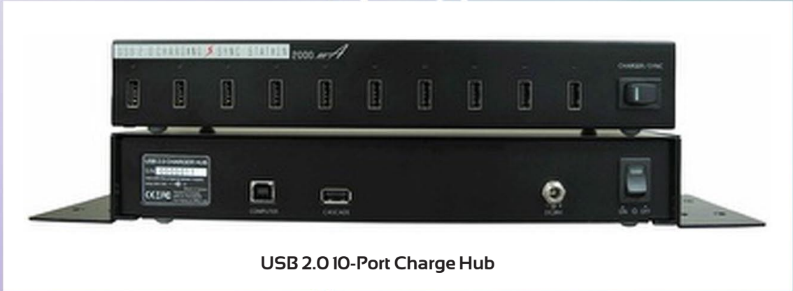
USB 2.0 10-Port Charge Hub