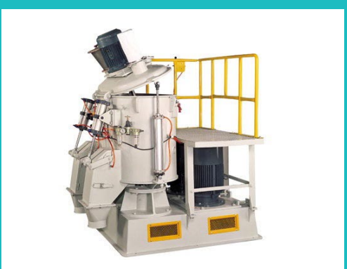
Dual Tank High-Speed Mixer Machine