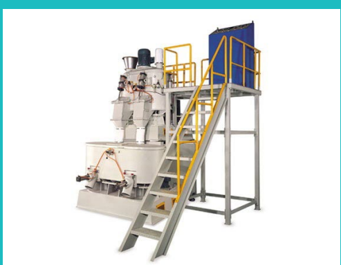
Dual Tank High-Speed Mixer + Vertical Water-Cooling Stirring Machine Series