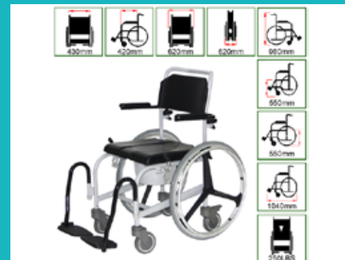
Commode shower chair