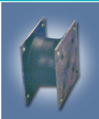
Sealing Component For Vibrating Machine