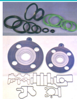
Sealing Component For Industrial Use