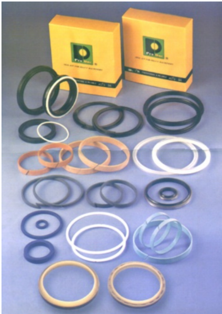
Sealing Component For Heary-Duty Construction Machine