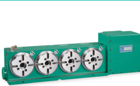
CNC Multi Spindle Rotary Table