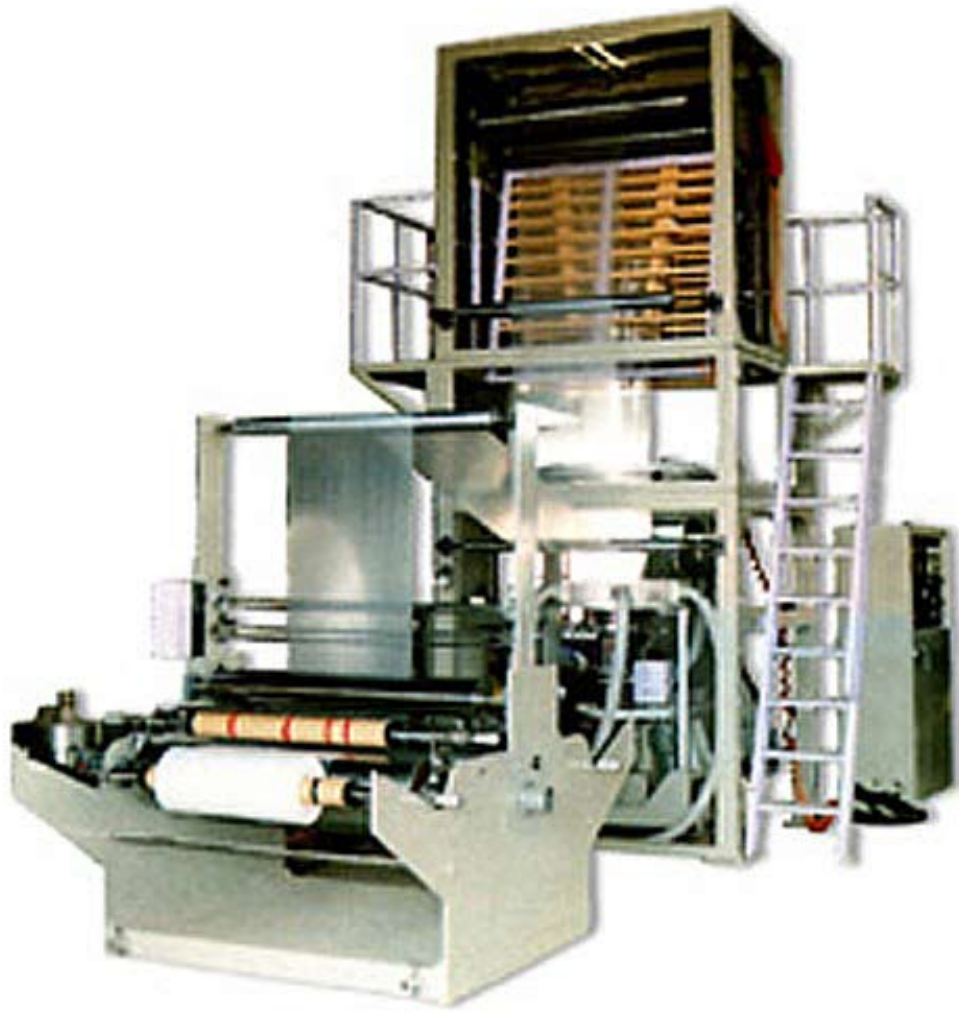
HIGH SPEED INFLATION TUBULAR FILM MANUFACTURING MACHINE