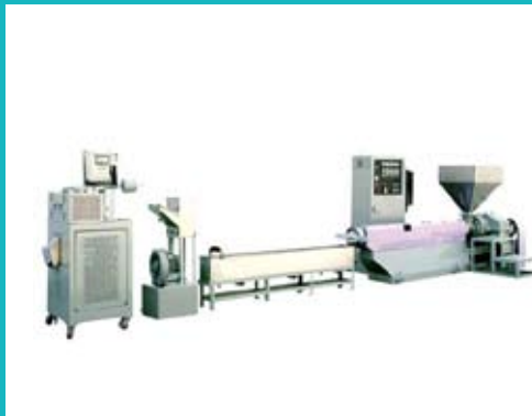
Plastic Waste Recycling Machine