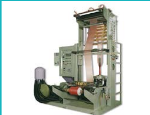
LDPE - HDPE - LLDPE Inflation Tubular Film Manufacturing Machine

Blown tubular film machine HDPE LD/LLDPE high speed PIT series. HDPE LD/LLDPE mini machine DMB series. PP bag making machine PP series. Plastic waste Recycling machine PHR-65EN - PHR-150EN PNR Series (for scraps and film, \phi 65 - \phi 150m/m ). PNR-SF Series