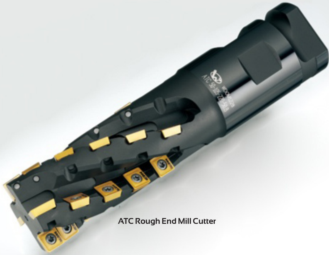
ATC Rough End Mill Cutter