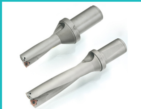
SD Disposable Rapid Drilling Tools