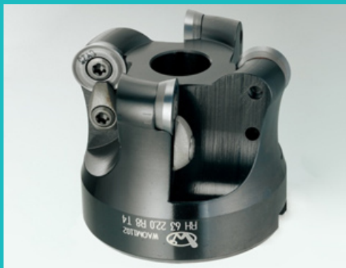
RH R-Type Surface Milling Cutter

Established in 1994, WEI GUAN has ample experience in making disposable tools for turning and milling. Insisting on using meticulously-selected materials while working with total professionalism, we turn out high-precision products with excellent stability. Stocking wide ranges of turning/milling tools, accessories and star-key wrenches, we ensure the shortest possible lead-time and high-efficiency service.