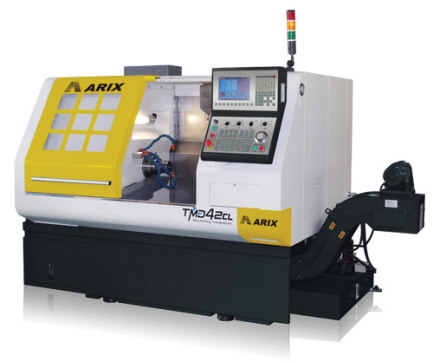
TM Series Turning Milling CNC Lathe