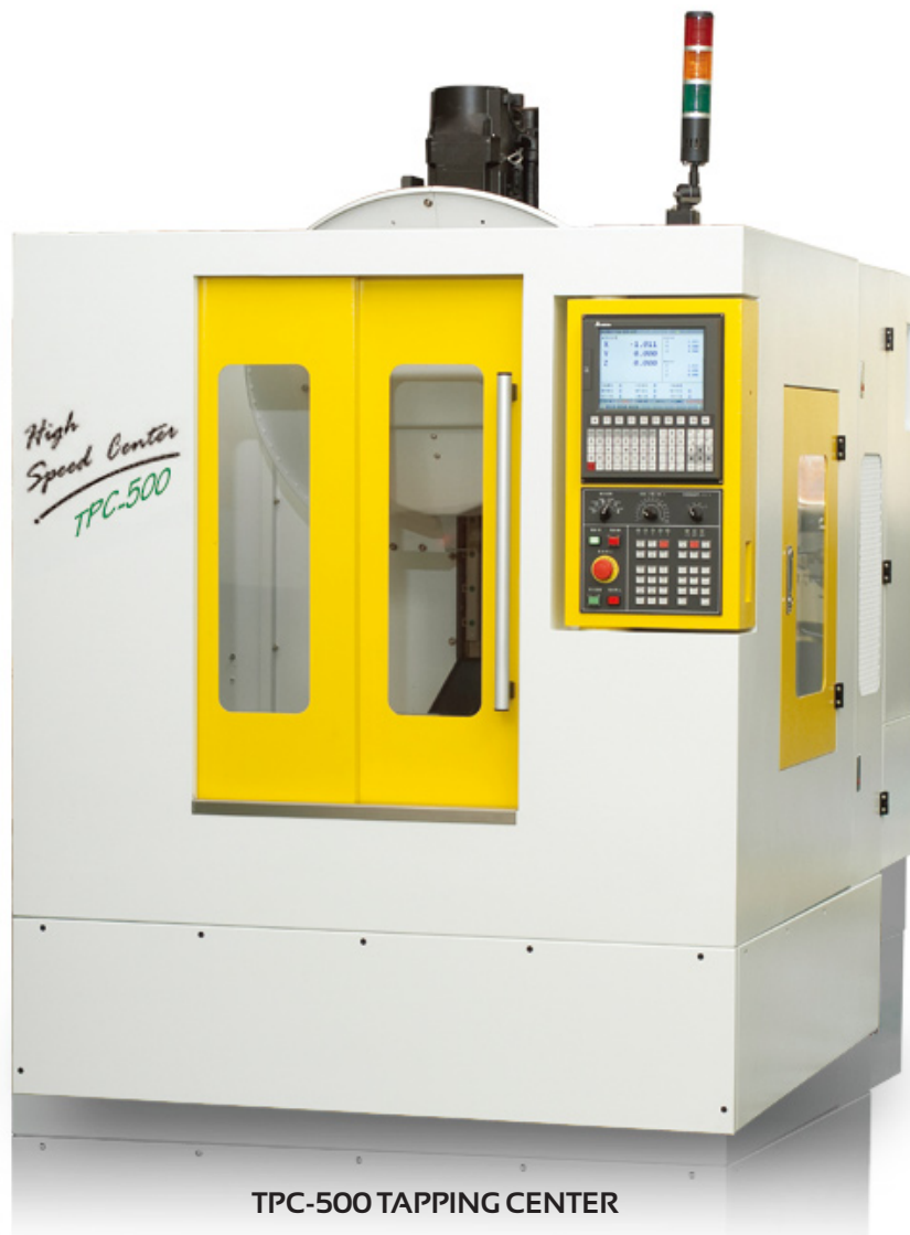
TPC-500 TAPPING CENTER