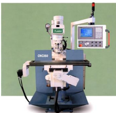
CNC Milling Machine

The Integrated team with a strong worldwide presence ARIX CNC was founded in 1995 by a group of experienced R & D engineers. This team consists of machine tool designer, computer hardware & software engineer, machining expert and international marketing engineer.