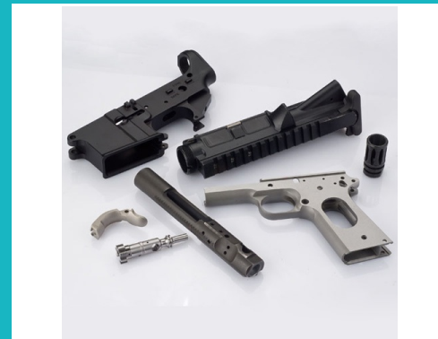
Light-duty Weapons / CNC Milling