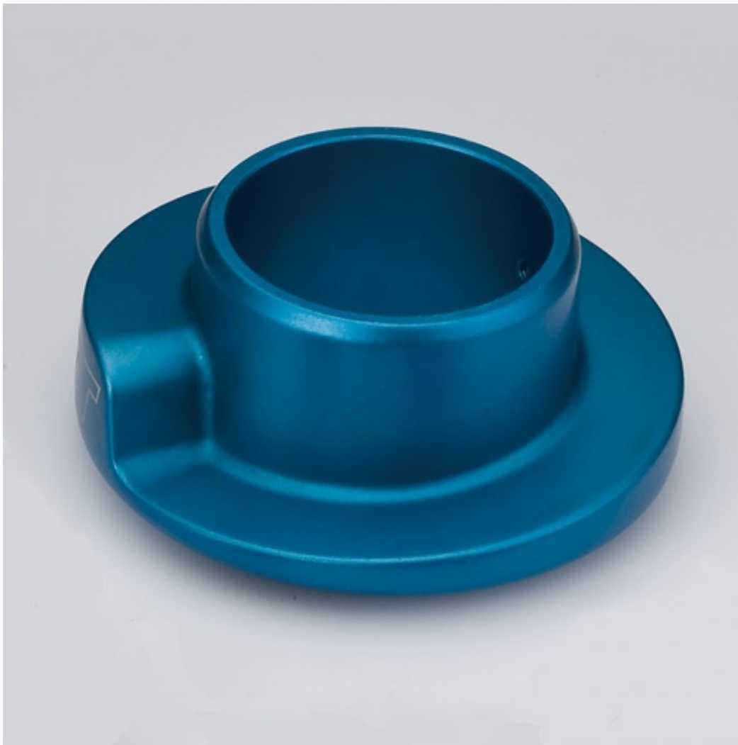
Auto Parts / CNC Milling