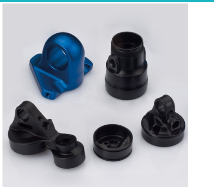
Bicycle Parts / CNC Milling

Set up in 1989, Zhan Cheng Precision Industrial originally designed and developed specialized tooling, jigs and clamps, and has diversified into milling and processing since 2001 backed by years of know-how. We have two factories that spread across some 14,400-square-feet and CNC milling machines, automatic milling machines, EDMs, as well as p ... [more]