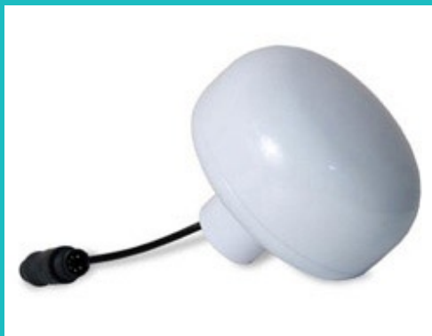
Marine GPS Locator