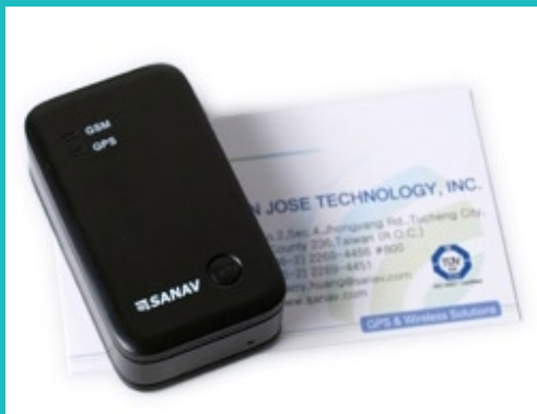
GPS/GPRS Pets/Asset Tracker

Located in Taiwan, we commenced operations in 1990 with our telecommunications technology. Later in 1995, in cooperation with prominent GPS companies in USA & Japan, we started our technical interflow & research on GPS technologies.