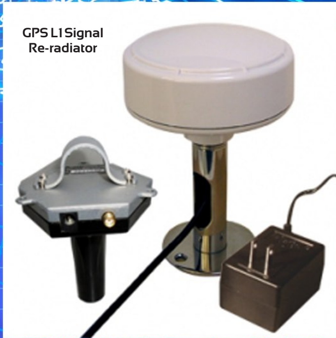
GPS L1 Signal Re-radiator