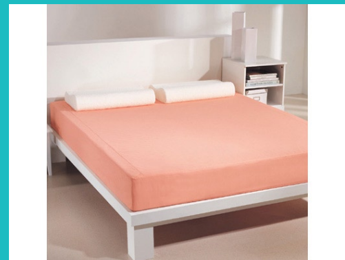
Anti-mite Mattress Cover