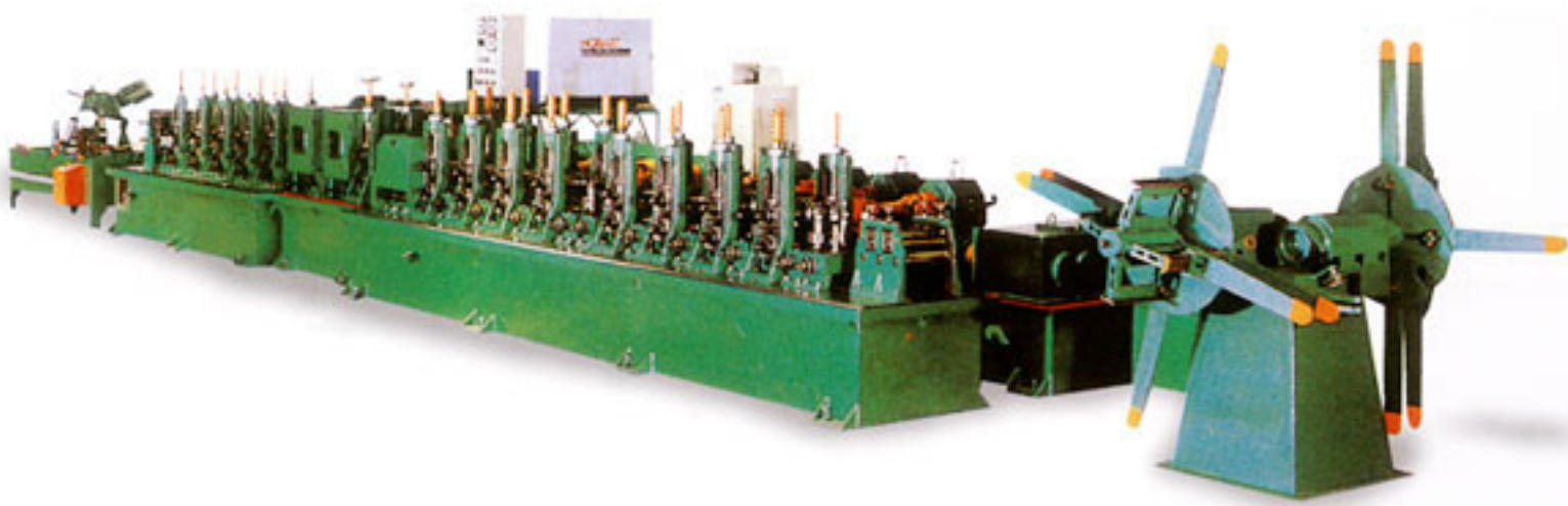
Stainless Steel Pipe Making Machine