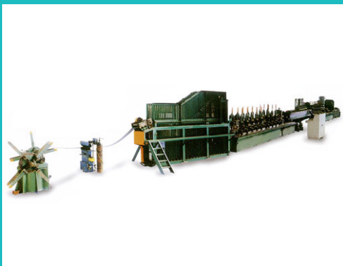
Carbon Steel Tube Making Machine