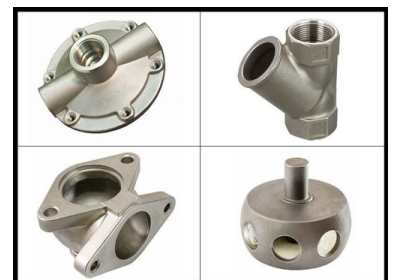
Precision Investment Casting