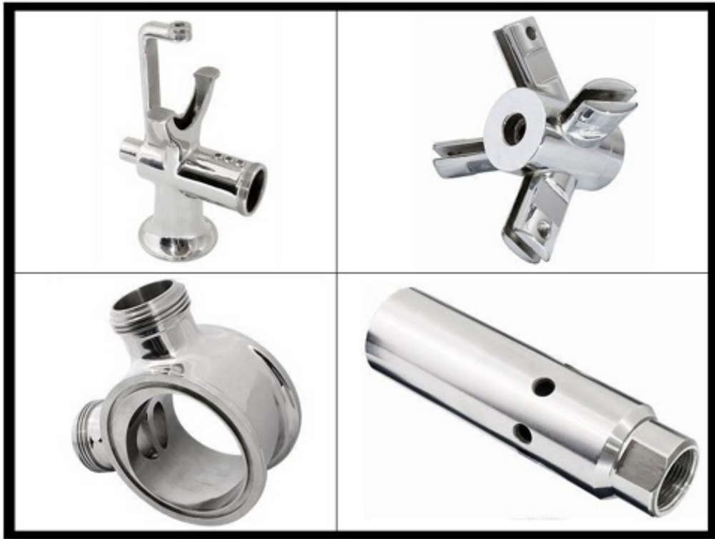
Investment Casting Parts