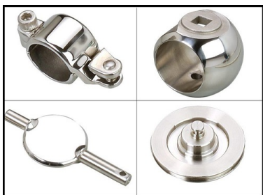
Lost Wax Casting Parts

Sawawada, founded in 1987, is a world-class manufacturer of investment casting located in Taiwan. In addition to investment casting, we also offer a broad choice of secondary operations to supply parts complete to print, including CNC machining, heat treating, polishing, plating, and subassembly. Sawawada has been working actively in production ... [more]