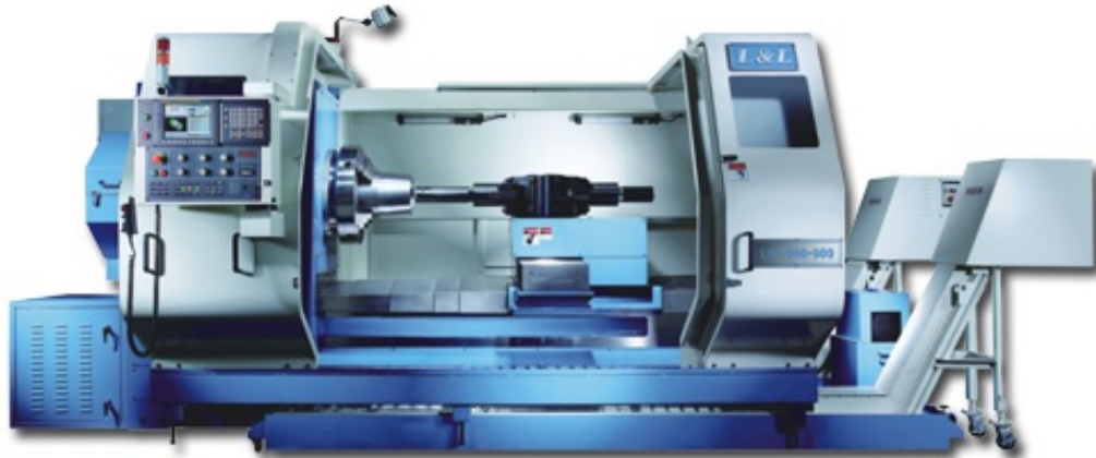
LS Series (Boring / Facing lathe)