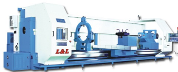
LFM Series(Roll turning lathe)