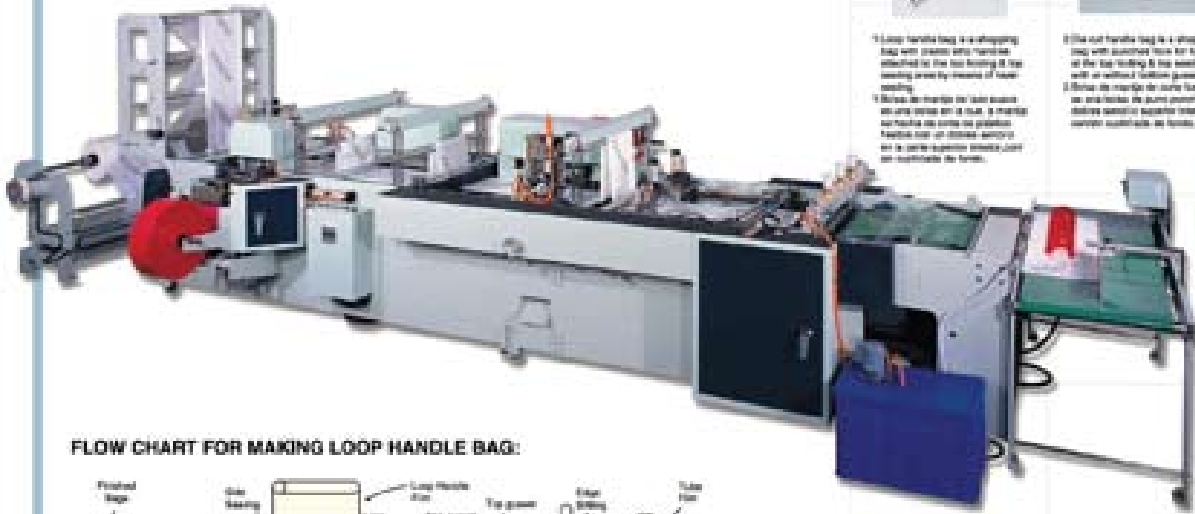
FLOW CHART FOR MAKING LOOP HANDLE BAG:

Fully automatic Loop handle, die cut handle, draw tape & patch handle bags making machine