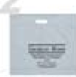
DIE-CUT HANDLE BAG

1. Die-cut handle bag is a shopping bag with handles that are formed at the top flange & top sealing area with an offset bottom gusset. 2. Etiqueta de manija de corte formada en el borde superior de la bolsa por medio de un sistema automático y sellado mediante un sistema conectado al fondo.