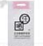
PATCH HANDLE BAG

1. Patch handle bag is a shopping bag with patch-handle that attached to the top of the PE bag by means of heat-sealing. 2. Etiqueta de manija parchada se une a la bolsa en la zona superior (PE) por medio de un sistema automático y se sella mediante un sistema conectado al fondo.