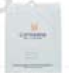
DRAW TAPE BAG

1. Draw tape bag is a garbage bag with a top of bottom flange and connected automatically with the top flange & top sealing area with an offset bottom gusset. 2. Etiqueta de manija formada en la parte superior de la bolsa por medio de un sistema automático y sellado mediante un sistema conectado al fondo.