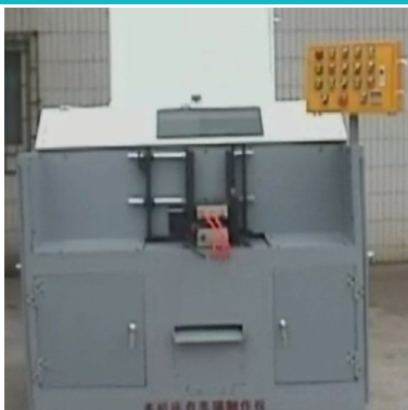
Automatic Open & Box-end Face Polisher

Multi-nationally patented. Cost-efficient, stable, fast, labor-saving, easy-to-clean. Founded in 1980, Yi Hong Industry Co., Ltd. currently focuses on designing and building hand-tool polishers as automatic wrench polishers and grinders. Always improving and innovating to offer highly-efficient, high-precision products, we will also negotiat ... [more]