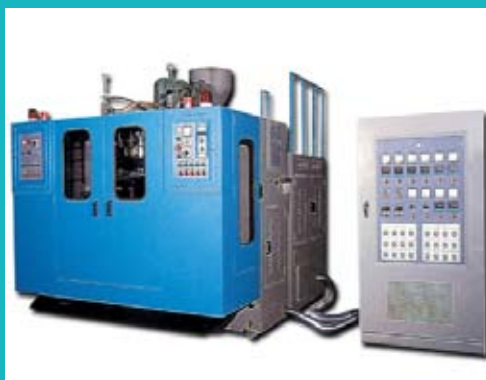
Plastic Injection Molding Machines