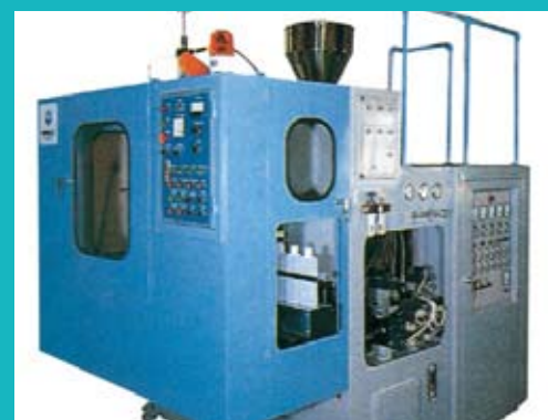
Plastic Injection Molding Machines