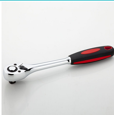
Ratchet Wrench w/Handle