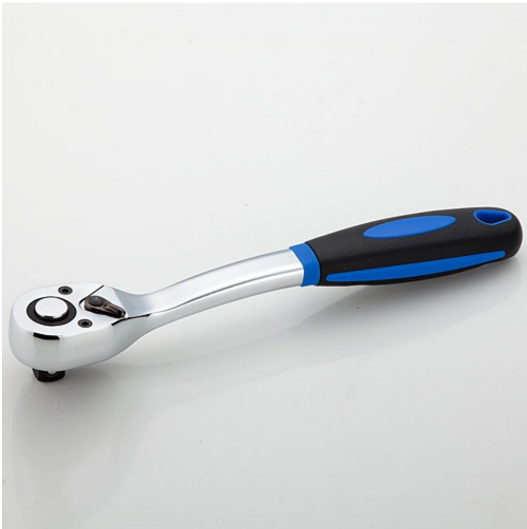
Ratchet Wrench w/Curved Handle