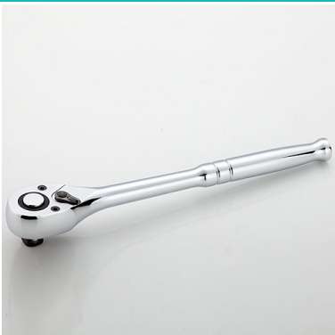
Ratchet Wrench w/Fully-polished Handle

Set up in 1994, John Metal Tools Industrial Ltd. mainly makes hand tools, and is a seasoned OEM of high-grade H handles who also accepts counter-production. In recent years we've been focusing on R&D and upgrading product quality, engaging in higher-level processing and in-house specification control, hence turning out items that are VPA and B ... [more]