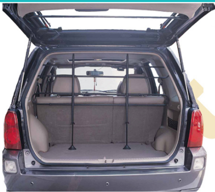
Cam Buckle Cargo Bar

We are an aggressive world class company, willing to take the initiative in developing innovative products. Presently, it is our goal to develop and produce high quality patented automobile parts and tools. Successfully achieving this goal has allowed us to produce products which have been well received in international markets.