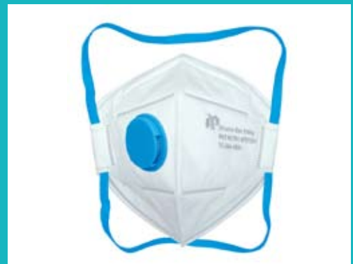
NIOSH N95 Vertical Foldable type Respirator with Valve