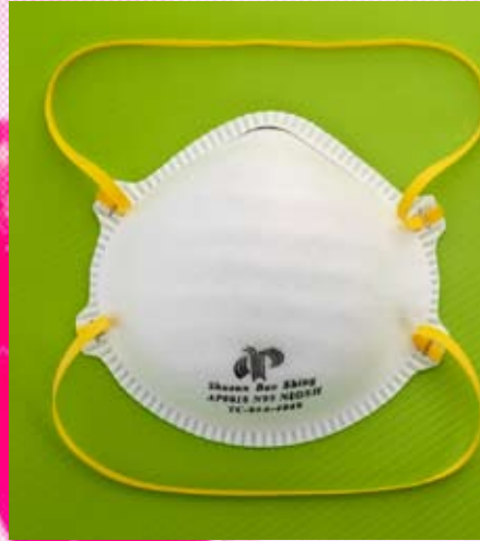
NIOSH N95 Mask Respirator for Surgical mask use