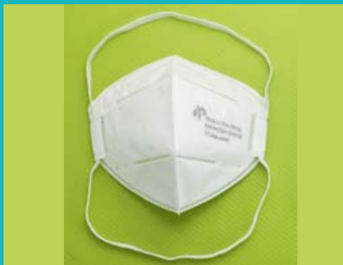
NIOSH N95 mask - Vertical Foldable type Respirator