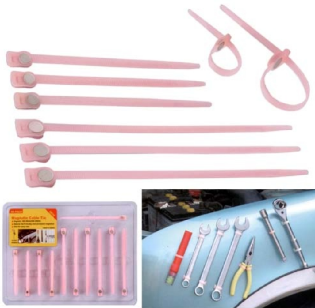
8PC Magnetic Cable Tie