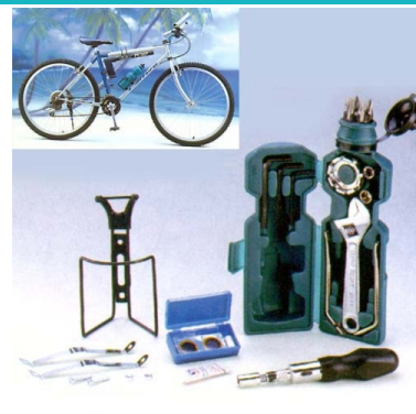
29PCS Water Bottle Bicycle Tool Set