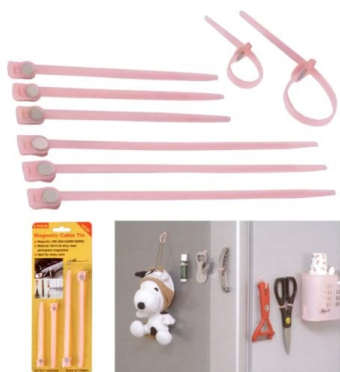
50PC Magnetic Cable Tie

Our company was founded in 1993. We own several products patents by our self. Our products have bicycle pump and repair tool kits, automobile repair tool kits, and Garden tools and so on. We have good products, high quality and true price. If you have any problem, please advise us.