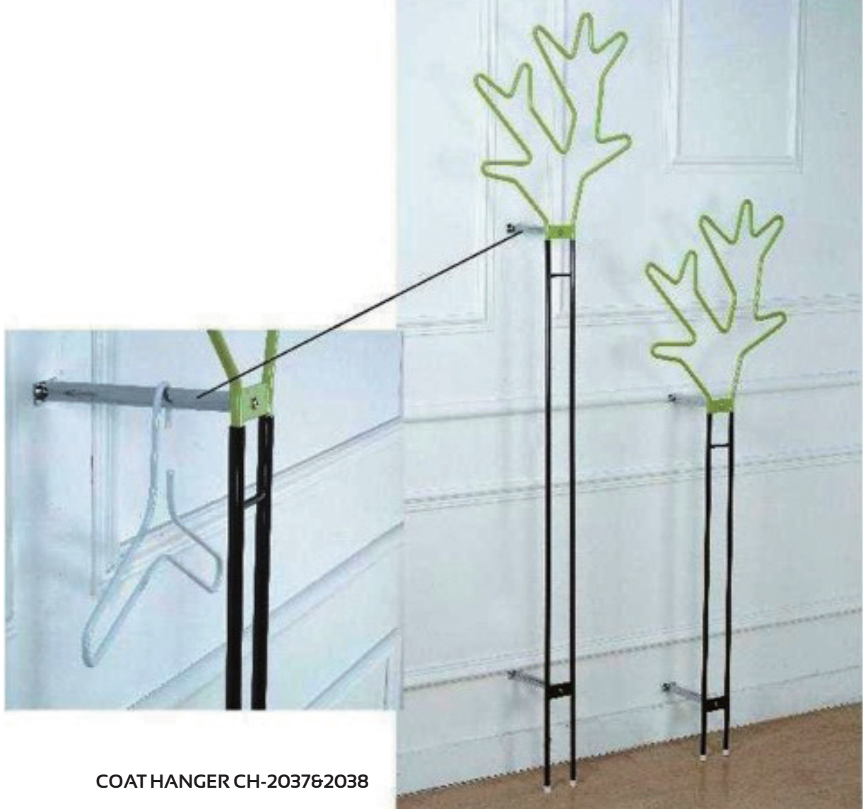
COAT HANGER CH-2037&2038