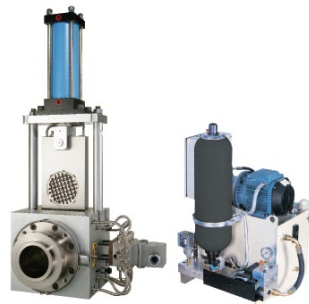
Hydraulic Screen Changer