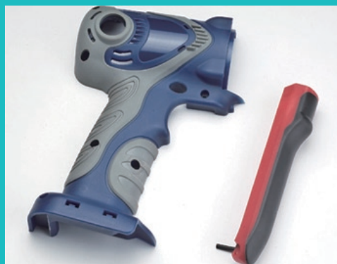
2-Color Plastic Injection ...