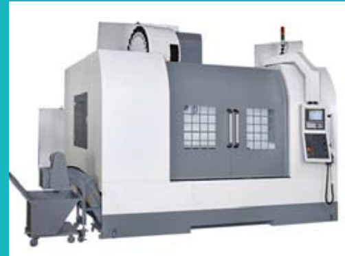
V-16 CNC Vertical High-Speed Machine