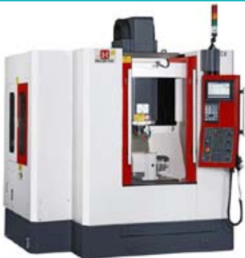
F-6 Five Axes CNC Vertical Double-Column High-Speed Machine

HELIOSTEC has always insisted on the corporate philosophy of "product innovation, technological excellence, Taiwan-based, and aiming at global market" since it founded in 2004. Our quality policies are "customer first, service satisfaction, innovative technology, and product of high quality".