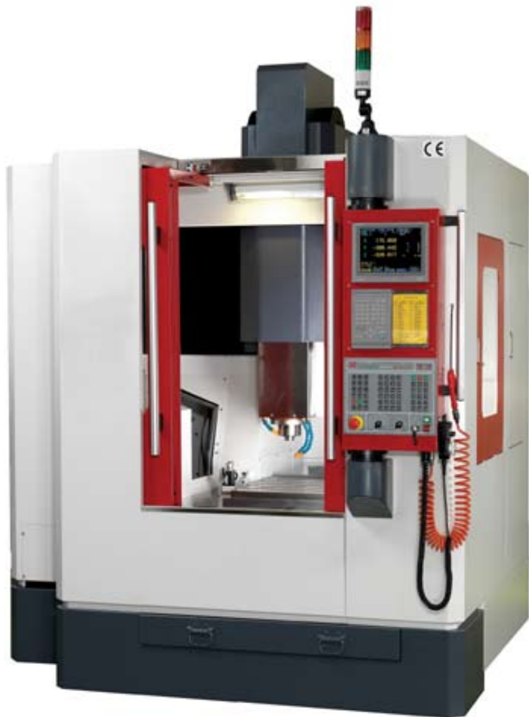
F-6 CNC Vertical Double-Column High-Speed Machine