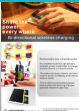
Bi-directional Wireless Charging Module

A veteran in R&D and manufacture of special power supplies and UPS, Winstream has long partnered with the U.S. Navy, Air Force, Siemens, and GE. Supplying products for industrial, medical, military, hi-fi, and traffic applications, we are sought-after by buyers from the U.S., Germany, Italy, Japan, South Africa, Indonesia, and Brazil.