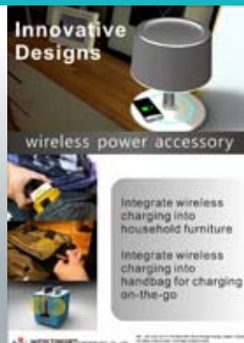
Wireless Charging Platform