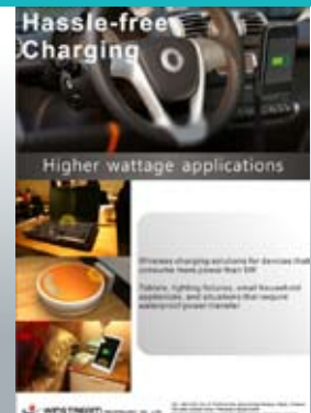
Wireless Charging Platform