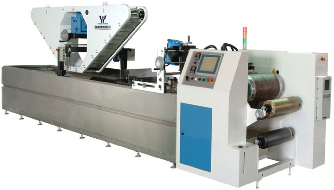
Automatic water transfer printing