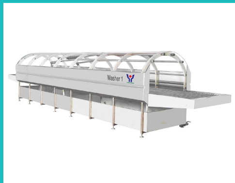
Tunnel-type washing machine