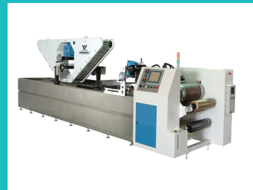
Automatic water transfer printing