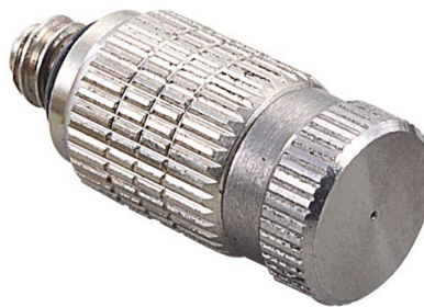
Quick-release T-joint for fine-misting nozzle