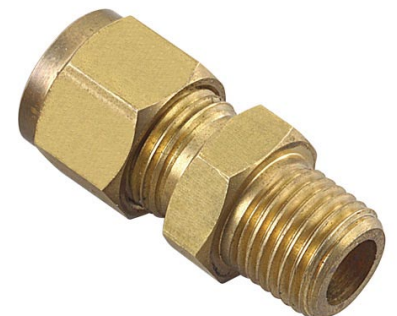
Single-hole joint for fine-misting nozzle