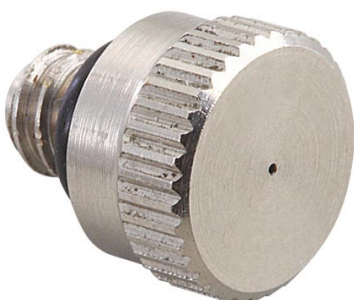
Parts for fine-misting nozzle

Founded in 1987, Chiang Tien makes automotive and PTW parts, accessories, and hardware using Japanese CNC lathes and Swiss-type multi-functional machine tools. In recent years, we've also launched fine-misting nozzles, parts and joints while also machining bars in stainless steel (#303, 304, 316), brass, iron, aluminum etc. in 2mm-40mm diameter.