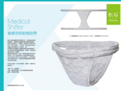
Manual Patient Transfer Device (Moving Auxiliary Belt)