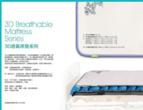
3D Ventilation Decompression Mattress

Kai Zhi Health Care Technology specializes in 3D ventilation series, including SGS, TTRI tests, cooling & moisture wicking fabric covers, health-enhancing 3D fiber layers etc. that ventilate, cool, relieve pressure, comfort to treat bedsores. Our mobility aides help patients move to minimize injuries to nurses and patients.