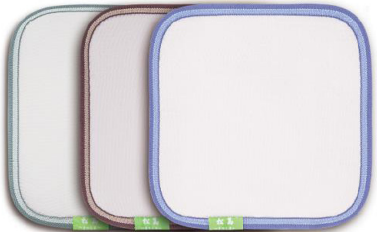
3D Ventilation Cushion (With & Without Back Support)