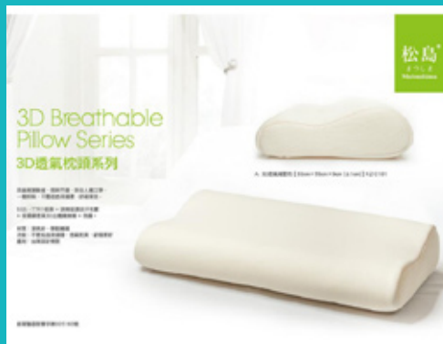
3D Ventilation Decompression Pillow