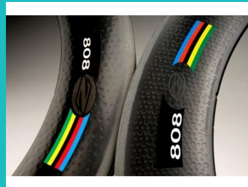
Aerodynamic Boundary Layer Control