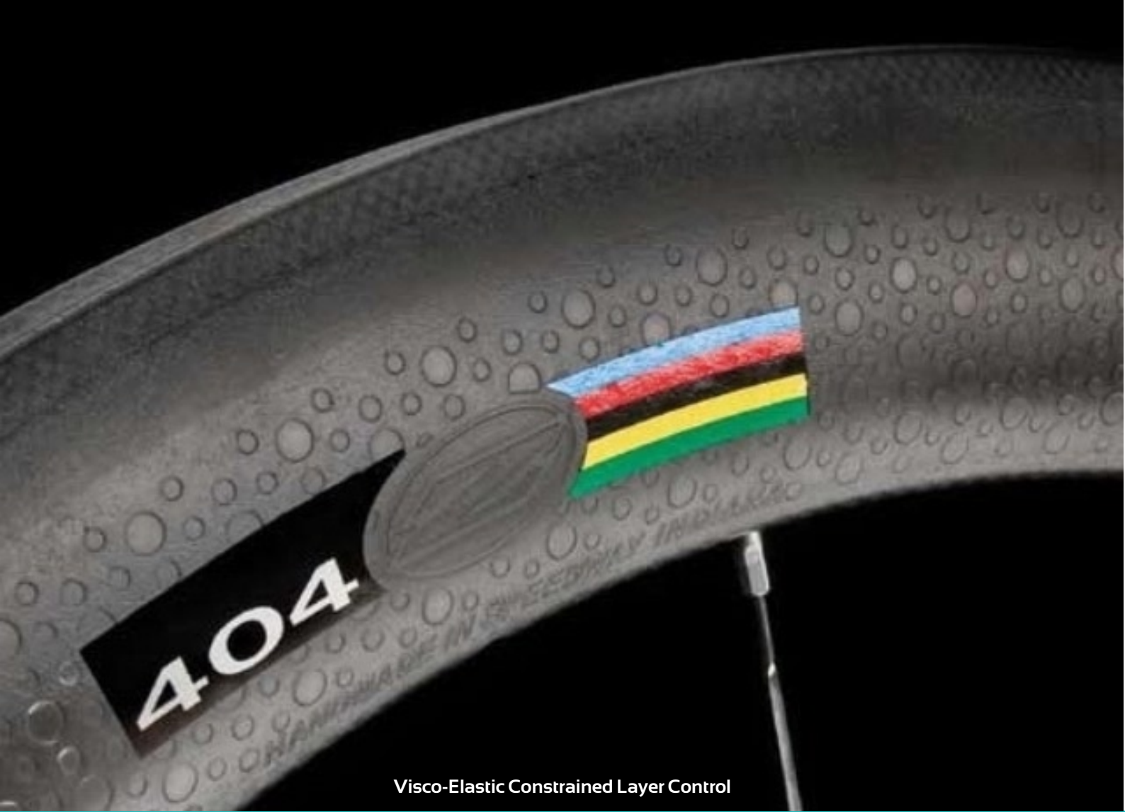
Visco-Elastic Constrained Layer Control