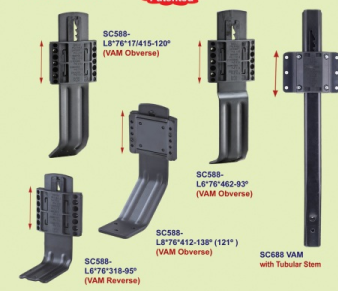
Back Hgt. Adj. Mech